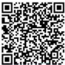
RSVP Ronald McDonald House

https://www.stjohnsuccchesterfield.org/fellowship