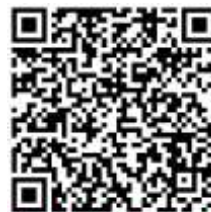
RSVP TABLE FELLOWSHIP