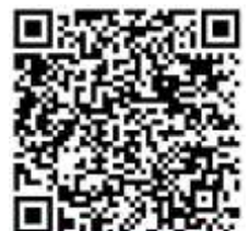
RSVP STEMMER FARM