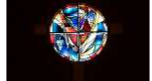
Stained-Glass Windows (Campaign Fund to repair Sanctuary Windows)