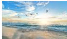
Building Fund For the Building and Grounds