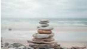
General Fund For St. John's UCC