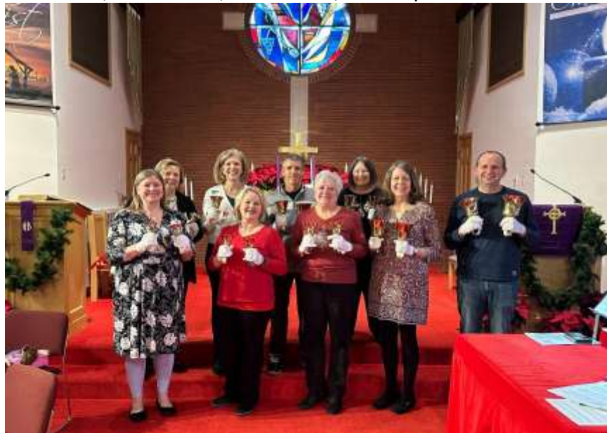
St. John's Bell Choir