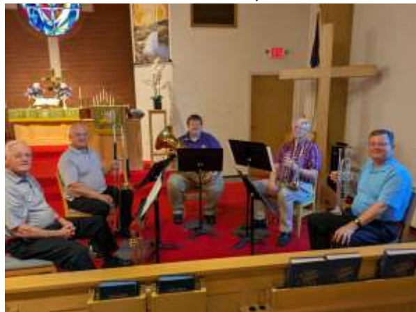
Mascoutah Brass Ensemble