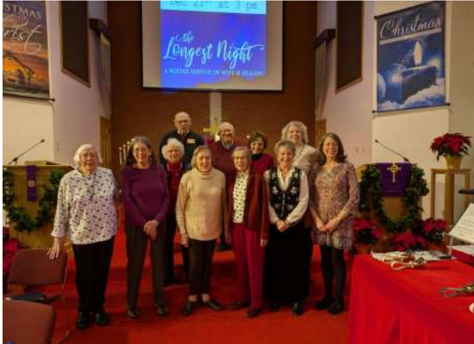
St. John's Vocal Choir

It is a joy to witness the congregation lifting their voices in worship, embracing both cherished familiar hymns and inspiring new ones.